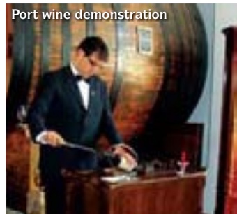
Port wine demonstration